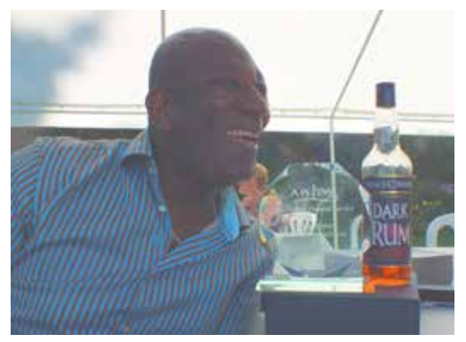
Voting for the 2017 Best Practice of the Year Who will steal Nev's crown? Page 8

Offices get ready for the festive period. Christmas Tree and Memorial Services (above RHH tree) Page 2 and 3