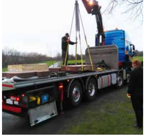
After a few sleepless nights the memorial was fitted in time for the family to dedicate the memorial.

We were asked to move this five tonne memorial from West Lothian to Nottingham Road Cemetery, Derby.